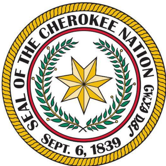
Seal of Cherokee Nation.

Cherokee Nation v. Georgia (1831) and Worcester v. Georgia (1832) are considered the two most influential legal decisions in Indian law. The U.S. Supreme Court ruled for Georgia in the 1831 case, but in Worcester v. Georgia, the court affirmed Cherokee sovereignty. President Jackson arrogantly defied the decision of the court and ordered the removal, an act that established the U.S. government’s precedent for the future removal of many Native Americans from their ancestral homelands.