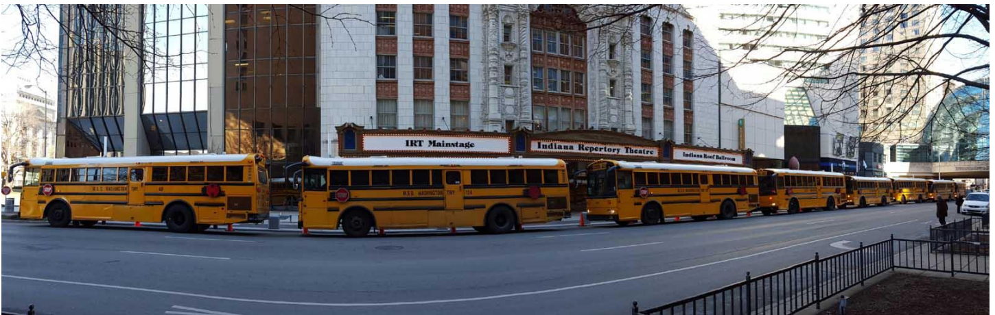
Busses lining the IRT curb during a student matinee.

Remain at your seat after the performance and IRT staff will dismiss your group to your busses if you are not staying for a post-show discussion.