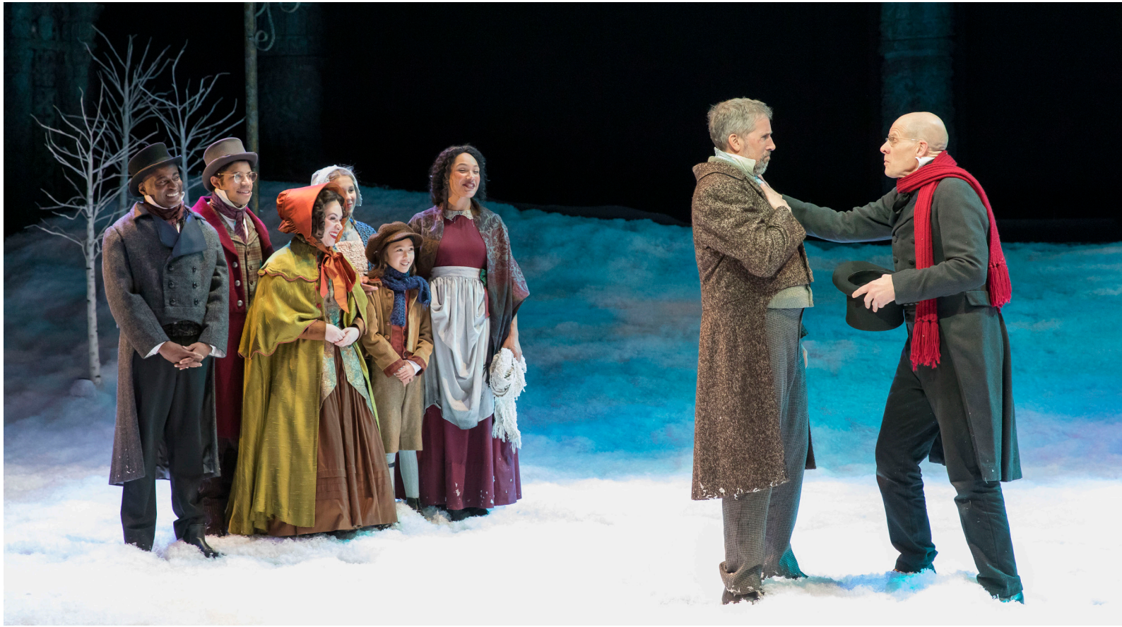
A changed man, Scrooge is now known throughout the town as kind and generous. Through his generosity, Tiny Tim is healthy and no longer walks with a crutch. Scrooge continues to keep the spirit of Christmas with him throughout the year, and spread kindness to all.