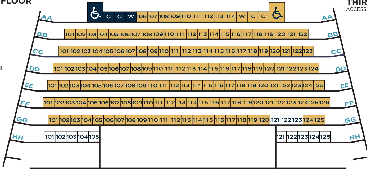
CENTER FOURTH FLOOR