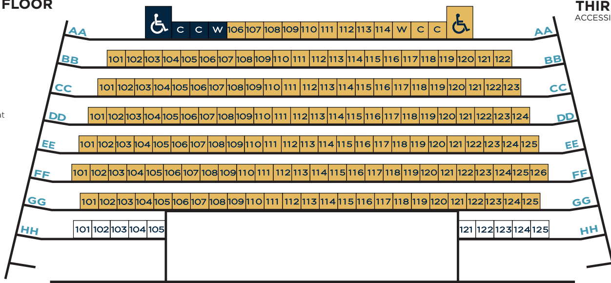
CENTER FOURTH FLOOR