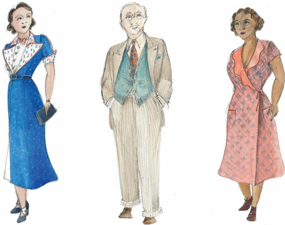
Preliminary costume sketches for Alice, Grandpa, & Reba by designer Tracy Dorman.

The play is set in Manhattan in 1936 at the height of the Depression. We chose to keep it in the time period because, although the themes and relationships are universal, much of the language and situations in the play are rooted in its time. This play is filled with characters with a capital C, and we've tried to find ways to express their eccentricities without stereotyping them. I've approached the designs of the costumes with a "heightened whimsy," using color, pattern, and silhouette to create a sense of the playfulness of this world the family has created in their home. So while the costumes evoke the period in their detail and silhouette, I've taken liberties so that they exist in their own world of the play—they are by no means naturalistic. There are so many characters to keep track of that one of the main goals is to create a strong visual identity for each one, which is actually quite easy as they are written so well: the playwrights give us so much info about who each character is.