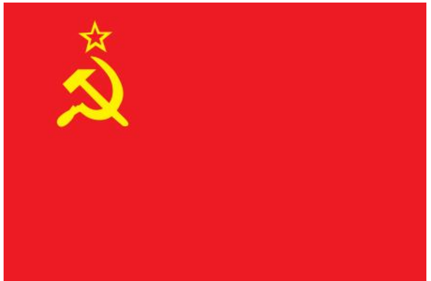
The Soviet red flag.

THE RUSSIAN REVOLUTION was actually a pair of revolutions in 1917 that dismantled the Tsarist autocracy and led to the rise of the Soviet Union. The old regime was replaced by a provisional government during the first revolution in February 1917; alongside it arose grassroots community assemblies (called "Soviets") that contended for authority. In the second revolution that October, the Provisional Government was toppled, and all power was given to the Soviets.