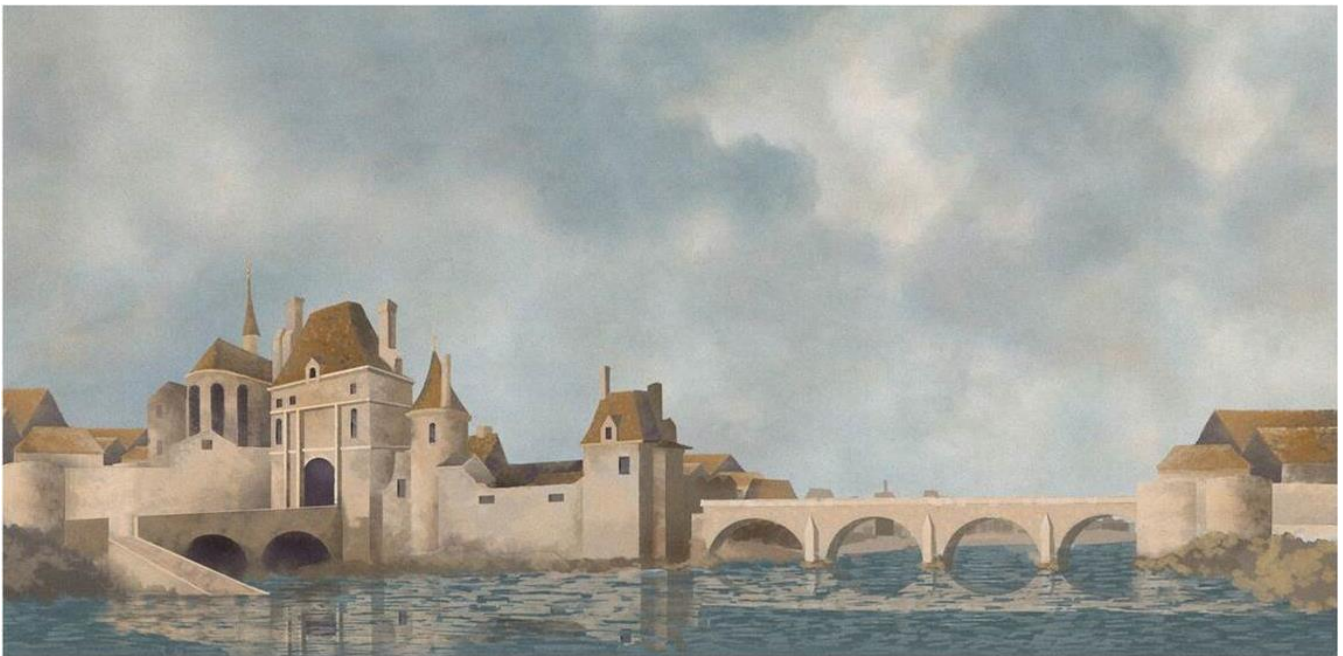
Paint elevation by scenic designer William Bloodgood.

Alexandre Dumas's original novel is a fanciful, imaginative adventure written in the 19th century but set in a much earlier time. We decided to play upon this dichotomy in the scenery for our IRT production by setting this modern stage adaptation in a design that borrows heavily from the theatrical practices and scenic conventions of 17th century France: the forced perspective lines and tracked, flat-painted wings that were the fashion of the time of Louis XIII.