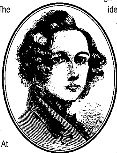
Charles Dickens (left) 1843, the year he wrote the Carol; (right) 1867

Dickens held strong views about the relationship between a lack of education and social oppression. He was giving a speech on education as the solution to England's problems when he conceived the idea of A Christmas Carol . Shortly thereafter, in the fall of 1843, he started writing the short book. He composed it in a frenzy, alternately laughing and crying at the images that occurred to him; and he polished it in his mind while walking the streets of London at night. With illustrations by Dickens' friend John Leech, the book was published at Christmastime 1843.