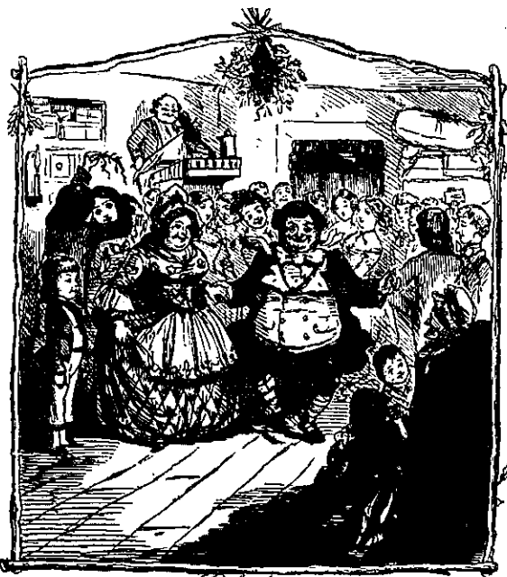
The Fezziwig Ball; illustration by John Leech, 1852

Scrooge visits Christmases from his past, the present, and the future. Write about a memorable winter celebration in your life from the past. What made it memorable? What were the sights, the sounds, and the smells? Or imagine a celebration in your future. Let your imagination run wild. Write a review of the play. What moments made an impression on you? How do the elements of scenery, costumes, lighting, and sound work with the actors’ performance of the text to tell the story? What ideas or themes did the play make you think about? How did it make you feel? A Christmas Carol is a holiday story told to teach its audience a lesson. Write a holiday story of your own that has a moral or teaches a lesson. Share it with your class and family.