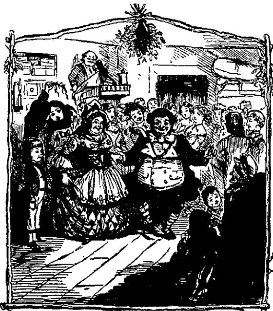
The Fezziwig Ball; illustration by John Leech, 1852

Scrooge visits Christmases from his past, the present, and the future. Write about a memorable winter celebration in your life from the past. What made it memorable? What were the sights, the sounds, and the smells? Or imagine a celebration in your future. Let your imagination run wild. Write a review of the play. What moments made an impression on you? How do the elements of scenery, costumes, lighting, and sound work with the actors’ performance of the text to tell the story? What ideas or themes did the play make you think about? How did it make you feel? A Christmas Carol is a holiday story told to teach its audience a lesson. Write a holiday story of your own that has a moral or teaches a lesson. Share it with your class and family.