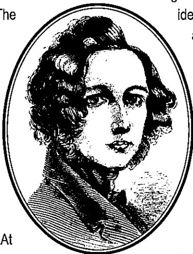
Charles Dickens (left) 1843, the year he wrote the Carol; (right) 1867

England’s problems when he conceived the idea of A Christmas Carol . Shortly thereafter, in the fall of 1843, he started writing the short book. He composed it in a frenzy, alternately laughing and crying at the images that occurred to him; and he polished it in his mind while walking the streets of London at night. With illustrations by Dickens’ friend John Leech, the book was published at Christmas 1843.