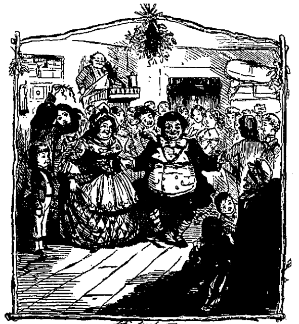
The Fezziwig Ball; illustration by John Leech, 1852

A Christmas Carol is a holiday story told to teach its audience a lesson. Write a holiday story of your own that has a moral or teaches a lesson. Share it with your class and family.