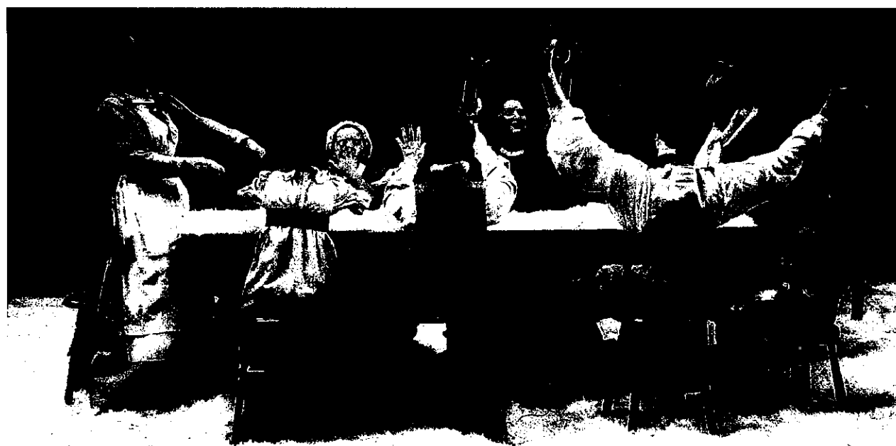
"One murmur of delight rose all around the board." The Cratchit family dinner, IRT production, 1998.