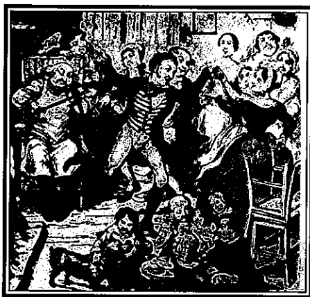
A country Christmas dance. Detail of illustration by Cruikshank (1847).

Indeed, Dickens is often credited with, if not inventing, at least revitalizing Christmas. A Christmas Carol , along with Dickens's other Christmas stories, enjoyed a wide audience, and these tales inspired people in their own holiday celebrations. Today we look back at the Victorian Christmas celebration with nostalgia and envy. But today's celebration, while perhaps less reverent, is if anything more pervasive and definitely more lavish. As Charles Dickens himself wrote in Sketches by Boz , "There are people who will tell you that Christmas is not what it used to be.... Dwell not upon the past.... Reflect upon your present blessings.... Fill your glass again, with a merry face and a contented heart. Our life on it, but your Christmas shall be merry, and your new year a happy one!" ★